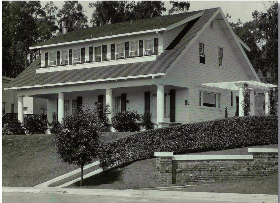
185 Westwood Back in the Day: A 20th century neighborhood icon built in 1920

It was a state-of-the-art home in 1920 – with all the latest appliances and time-saving features to make family life comfortable in the post-World War I era. Today, nine decades later, the Roccas are