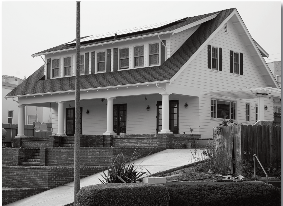
185 Westwood Today: A state-of-the-art home has solar panels and wireless controls

continuing that state-of-the-art tradition by gracefully updating their historic home to the 21st century.