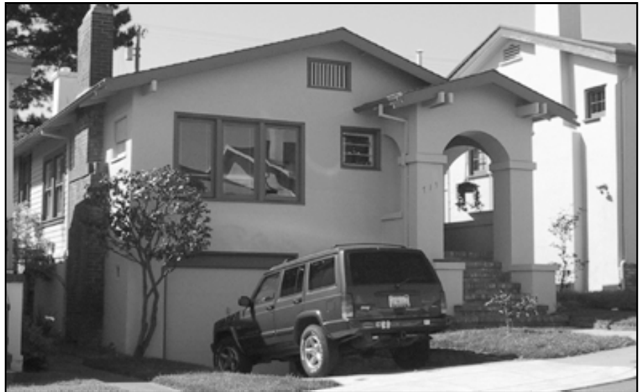
5% of the estate of this Westwood Park Home was left to the Association in 2002.