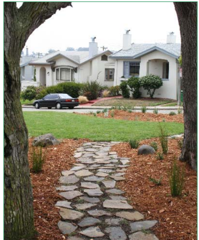
The Upper Plymouth Green Complete all photos by Greg Morris