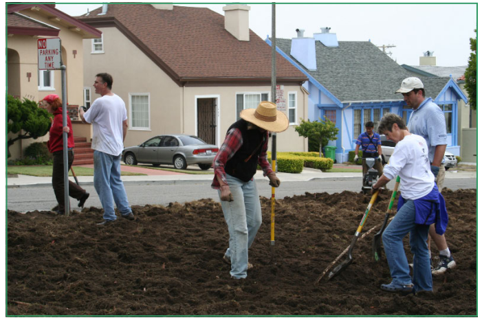
Volunteers unearth old pipes and work the rototillers on the Upper Plymouth Green, by Greg Morris