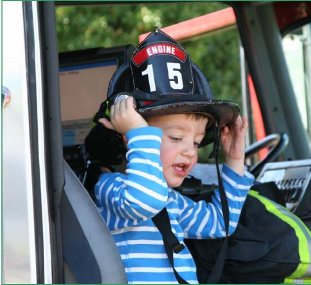
Future firefighter tests the equipment

A good time was had by all at our annual picnic and meeting on September 27.