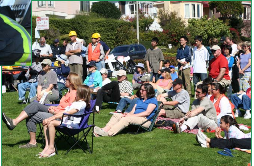
Neighbors enjoying the great weather