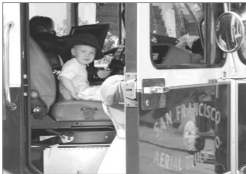
Westwood Park's youngest firefighter.