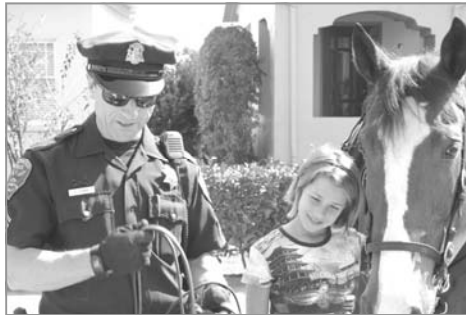
A police horse joins the picnic.